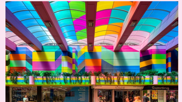
Endless Ribbon by Morag Myerscough Creative Giants - Projects