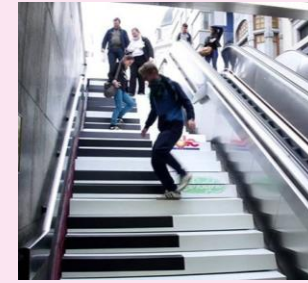
Encourage use of stairs with Fun Theory's piano staircase