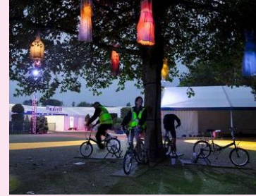
People riding bikes light up lanterns by Electric Pedals